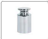
calibration weight (included)