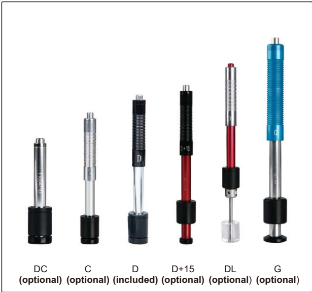
DC (optional) C (optional) D (included) D+15 (optional) DL (optional) G (optional)