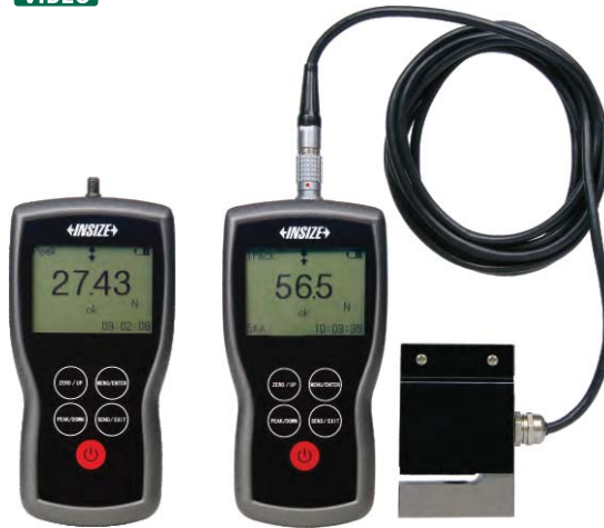
ISF-DF100A type A