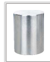
4kg weight block (optional) for ISH-S30D