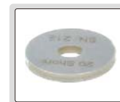
calibration block (included)