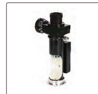
measuring microscope (included)