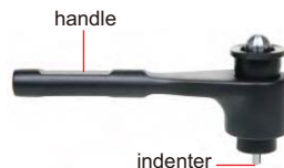
impact test handle