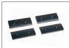
supports for cylinder or tube workpieces (included)