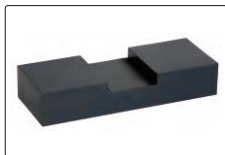
flat anvil for test block (included)