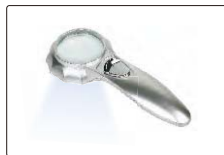
magnifier with LED (included)