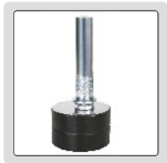
test flat surfaces (with the cover)