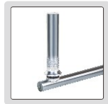
test cylinder surfaces (use V-groove on the cover)