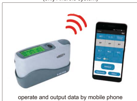
operate and output data by mobile phone

connect to mobile phone via bluetooth (only Android system)