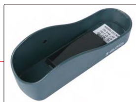
base with calibration block (included)