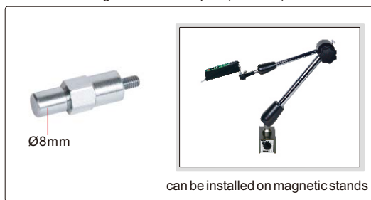
magnetic stand adapter (included)