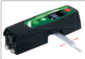
probe can be set at 90°, for transverse measurement