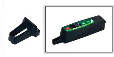
probe cover (included)