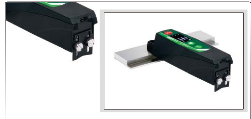
adjustable stand (included)