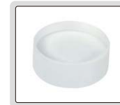
optical flat (included)