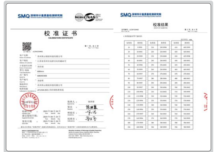
ISO17025 Calibration certificate