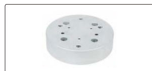
adaptor (optional, for digital torque tester IST-TT5, IST-TT30, IST-TT50, IST-TT220)