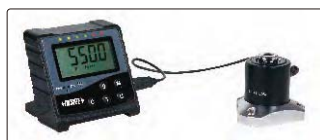
digital torque tester (optional)